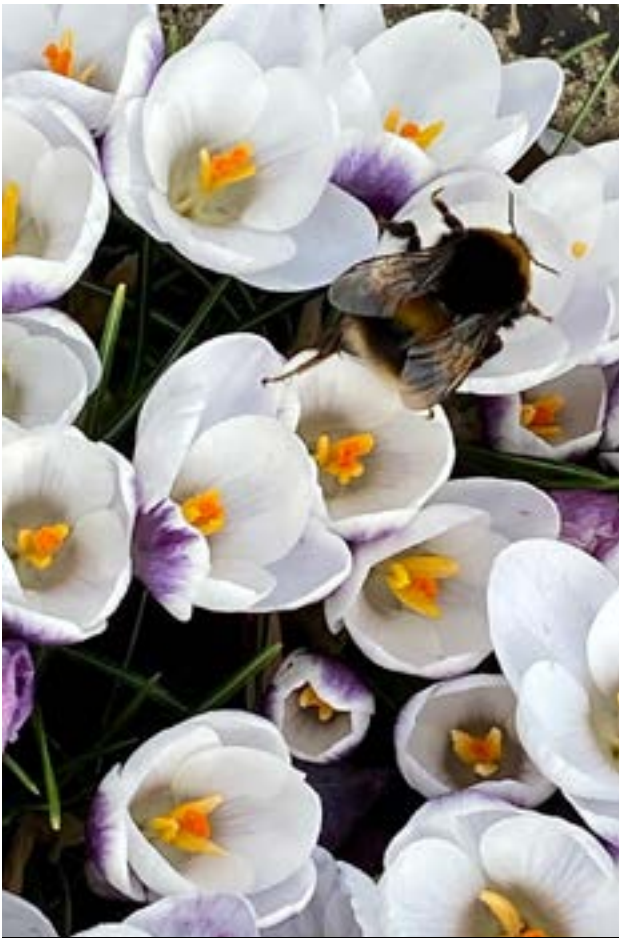
A bee enjoying crocus.