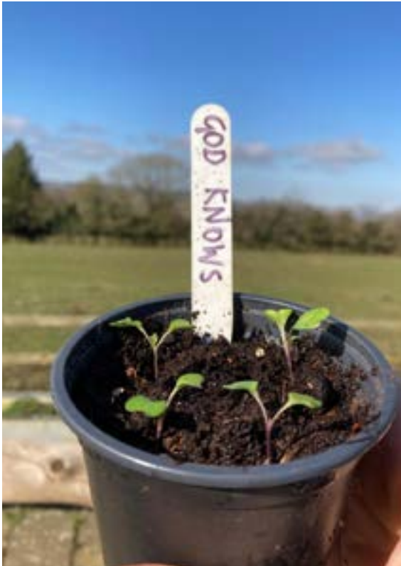
Plant marker fell out. Any ideas what they are?