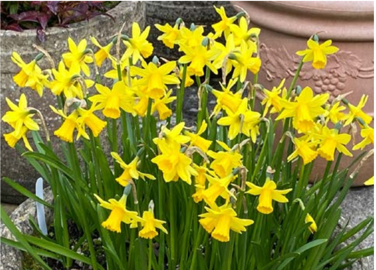
'Tête-à-tête' dwarf Daffodil