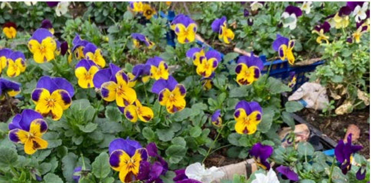
Violas growing well in the greenhouse

Remember please keep sending in your photos they can be anything horticultural or wildlife based through to the environment and life in the Chilterns horticultural.society@btconnect.com