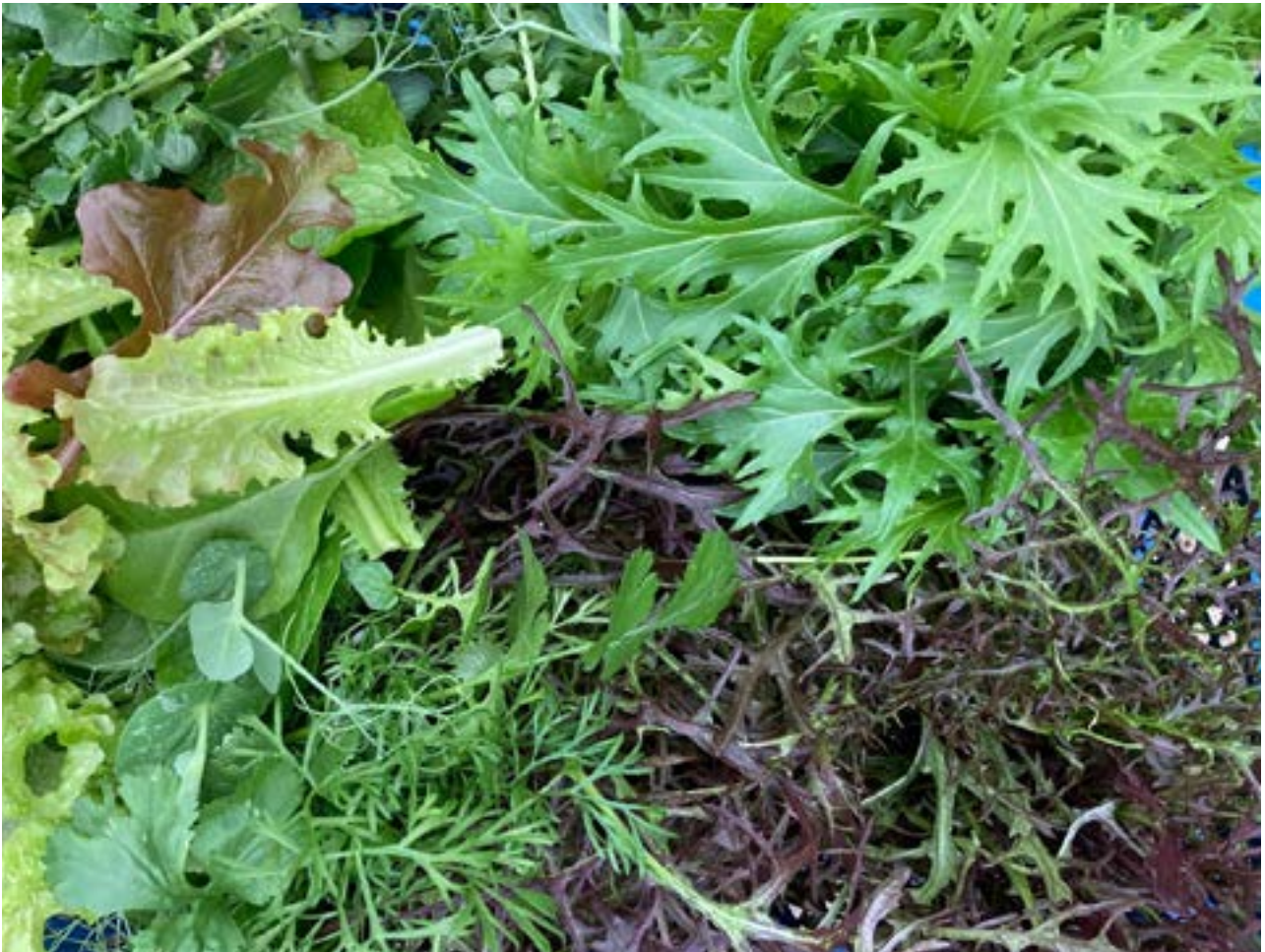
Salad plants over wintered in the greenhouse doing well in the Spring light.