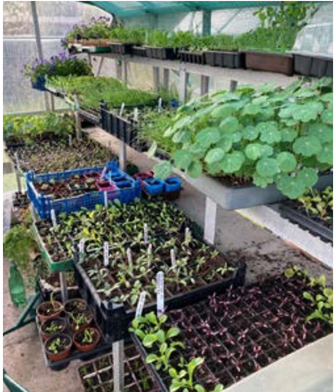
Greenhouses nearly at bursting point.