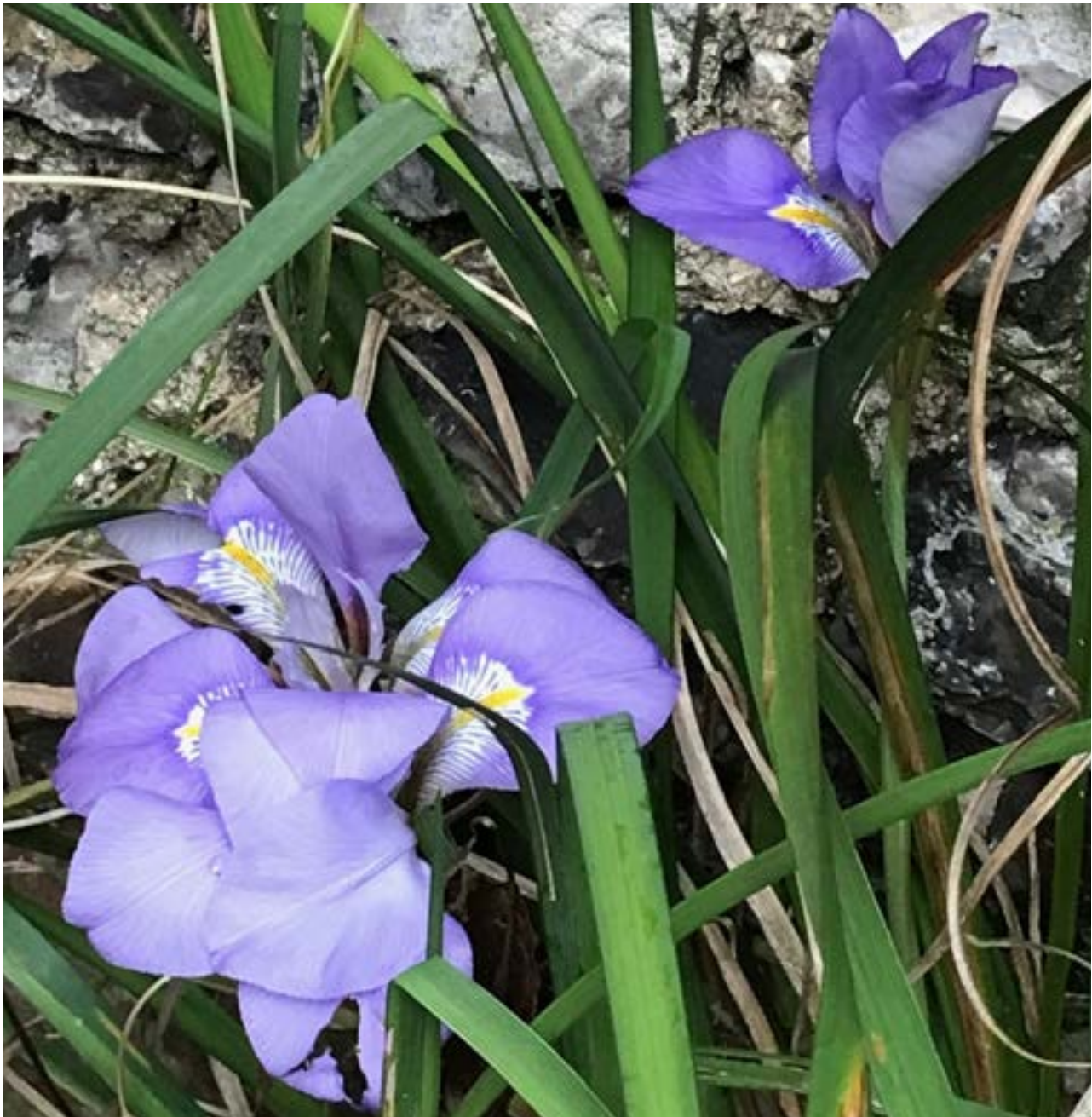
Iris reticulata flowering in February