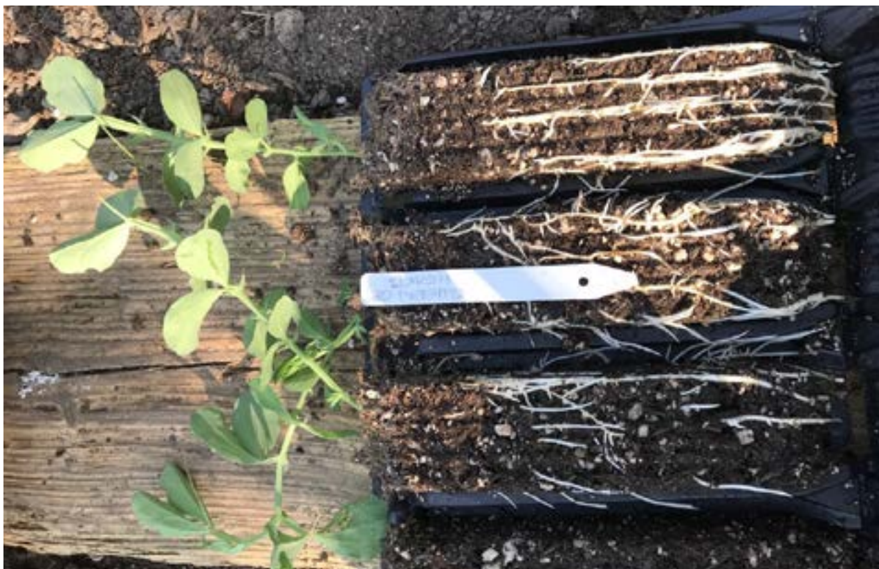
Sweet Peas ready to go outside.