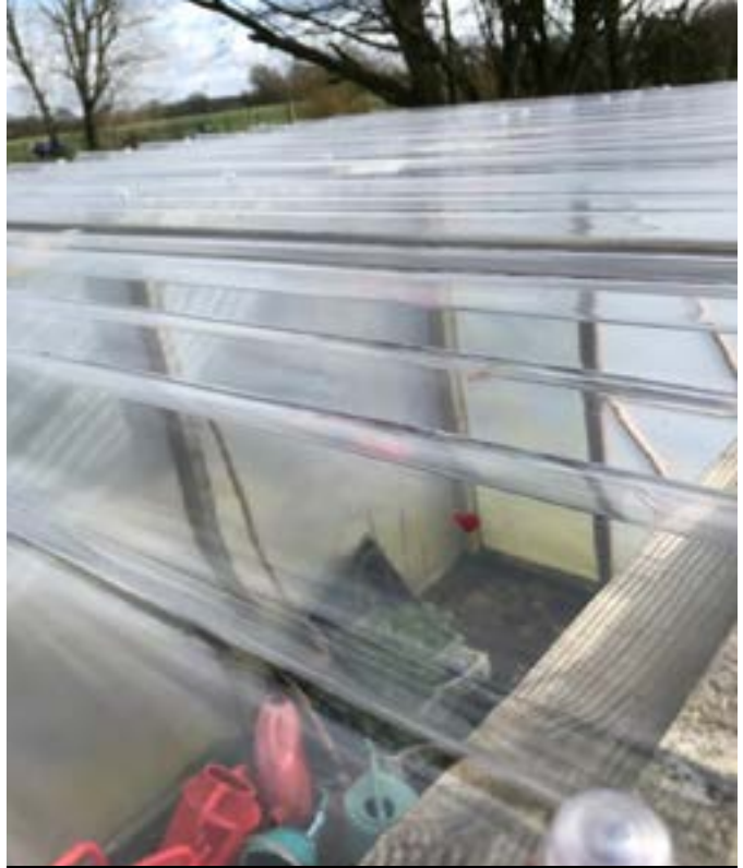
New Roof for the school greenhouse