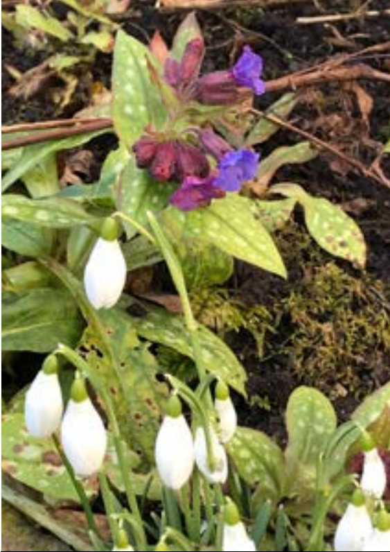
Pulmonaria and Snowdrops